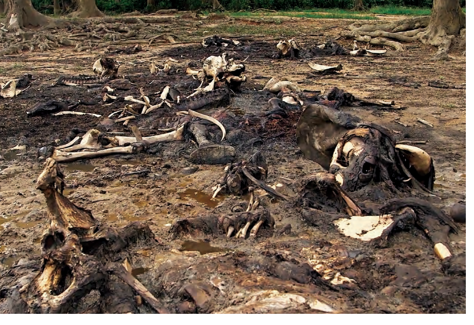
In May 2013 poachers with the insurgent group Seleka massacred 26 elephants at Dzanga Bai, a mineral-rich watering hole in CAR.